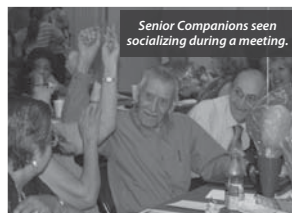
Senior Companions seen socializing during a meeting.